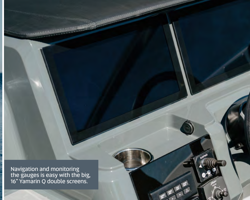
Navigation and monitoring the gauges is easy with the big, 16" Yamarin Q double screens.