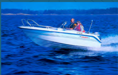
Yamarin 4700 BigRide (1993)

The recession had not yet reared its head when Kesko Marine had its first real boost in export in 1990, which is when Yamarin's export to Sweden, Norway and the Netherlands was first started.