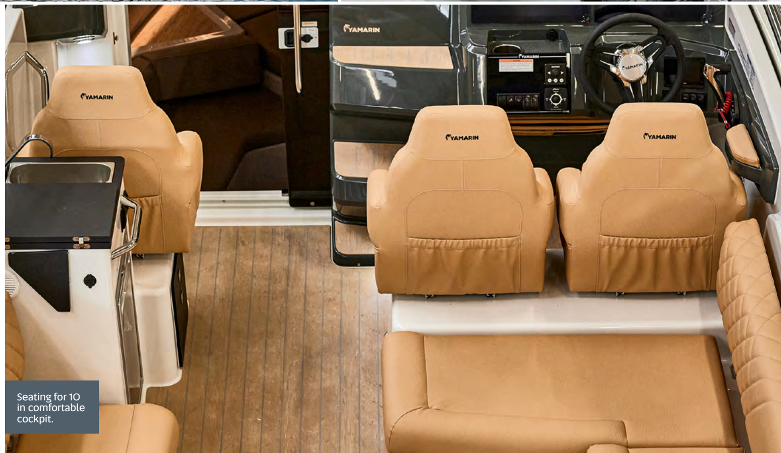
Seating for 10 in comfortable cockpit.