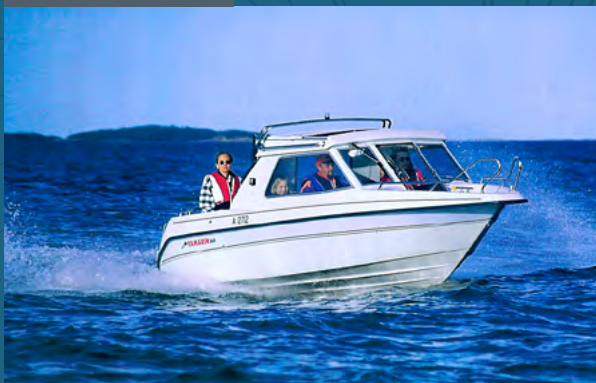
Yamarin 560 BigCatch (1993)