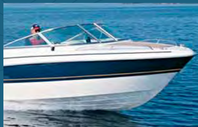
Yamarin 6100 BigRide (2000)

The first new model of the millenium was the Yamarin 6100 BigRide .