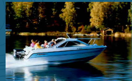
Yamarin 575 (1989)

The image of Yamarin's excellent operability and competitive quality for the price was also formed around the time.