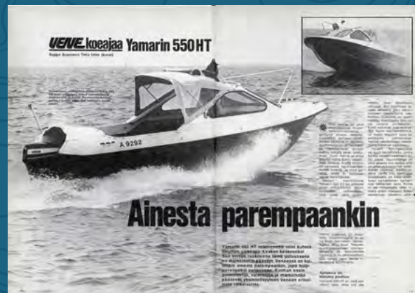
Yamarin 550 HT was introduced in Vene boat magazine test in 1976.

The first Yamarin Hard Top model was unveiled in 1975: 555 HT , which paved the way for Yamarin's future HT successes. As the only Nordic walk-through model, it is miles ahead of its competition.