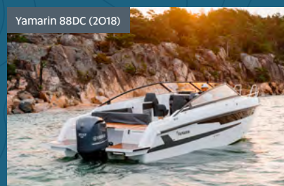
Yamarin 88DC (2018)

In 2018, Yamarin's largest model of all time was unveiled in the shape of its new impressive flagship, the Yamarin 88 DC , a model representing the new design language.