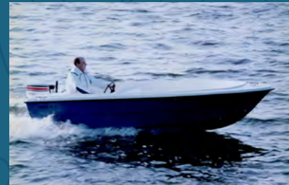
Yamarin 425R (1983)

Only five years after creating its own boat brand, Yamaha rose from a relative unknown to be the clear-cut leader in the Finnish outboard motor market, and it was there to stay!