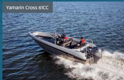
Yamarin Cross 61CC

Yamarin's unveiling of their new aluminium hull Cross line-up .